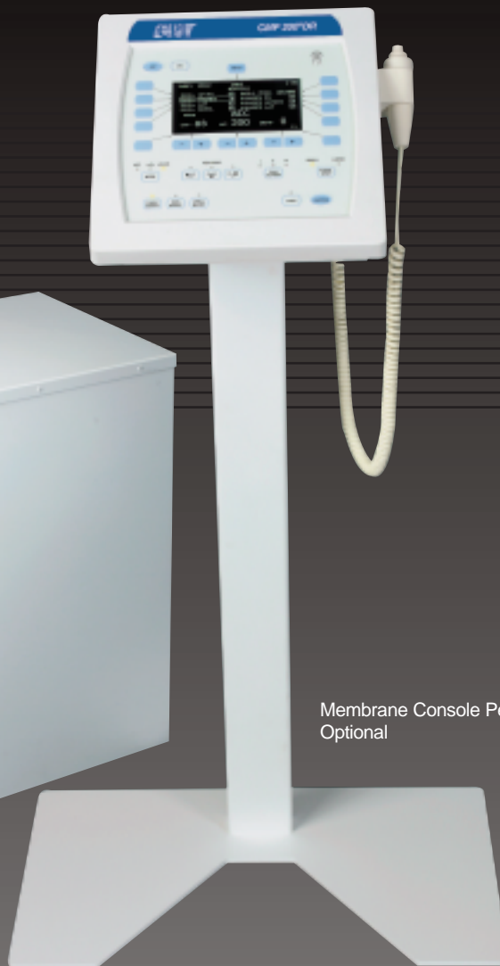
Membrane Console Pedestal Optional