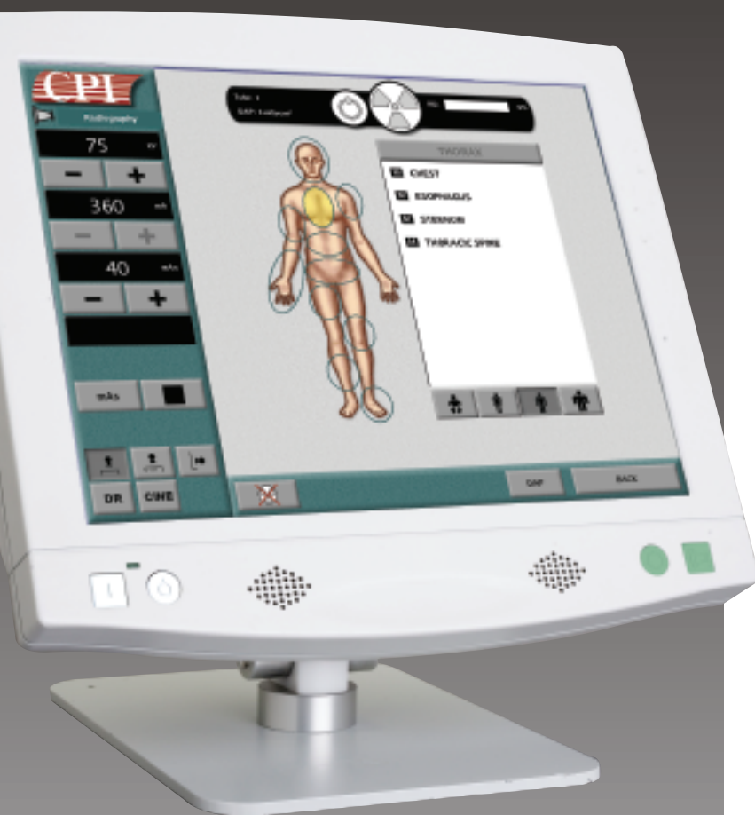
Touch Screen Optional