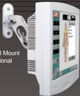
Wall Mount Optional