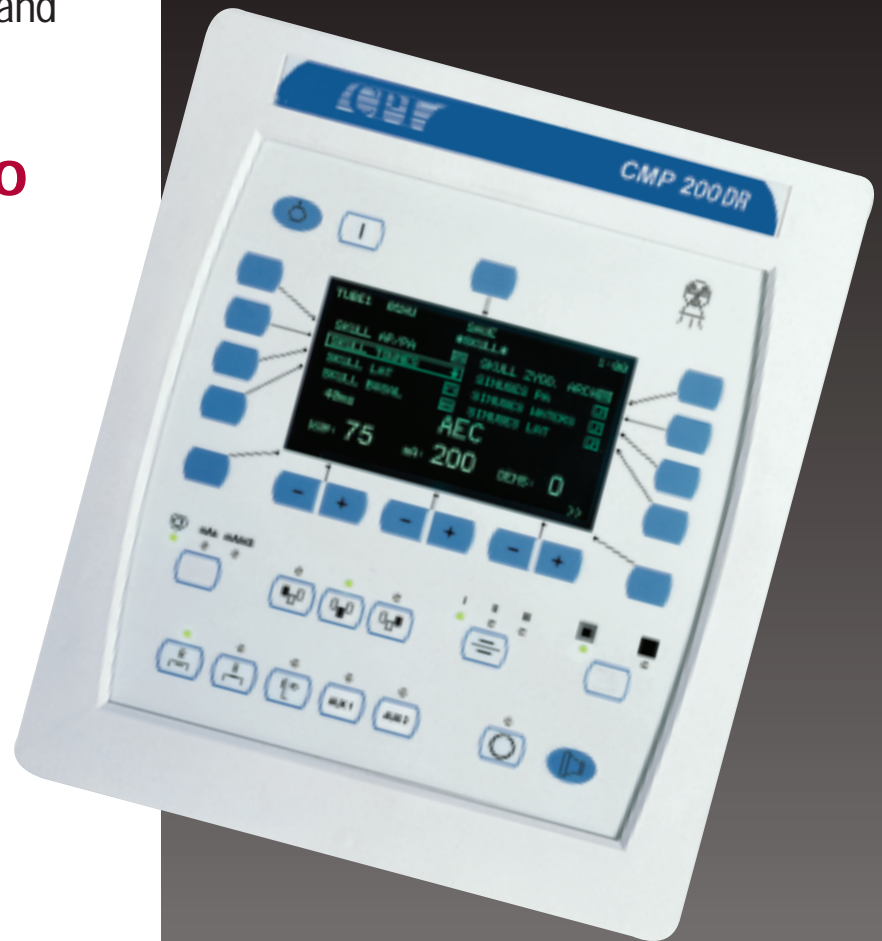
Membrane Console Standard