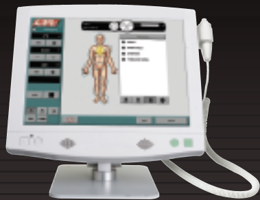
Exposure Hand Switch Optional