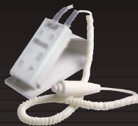
Mini Console Optional